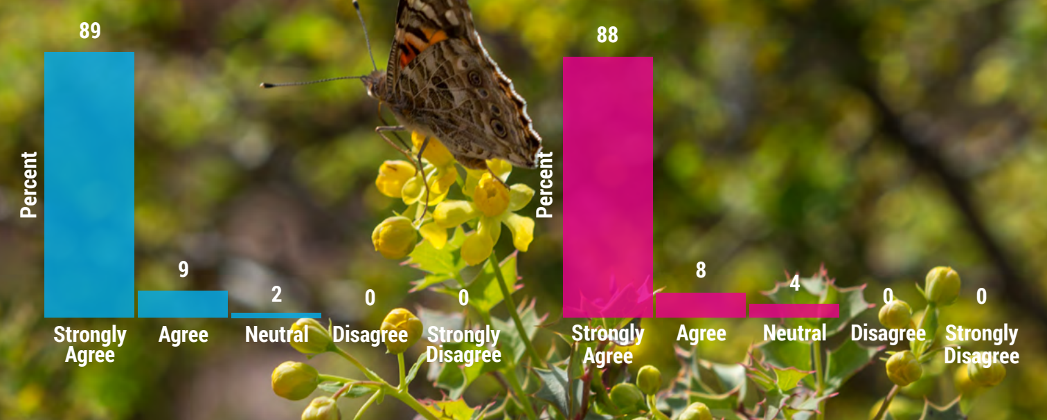
FIG. 7 Ninety-six percent of our visitors strongly agreed (88%) or agreed (8%) that the learning environment at the field station is difficult to replicate on campus (n = 401).

FIG. 6 Ninety-eight percent of our visitors strongly agreed (89%) or agreed (9%) that their educational experience was enhanced by their field-station visit (n = 402).